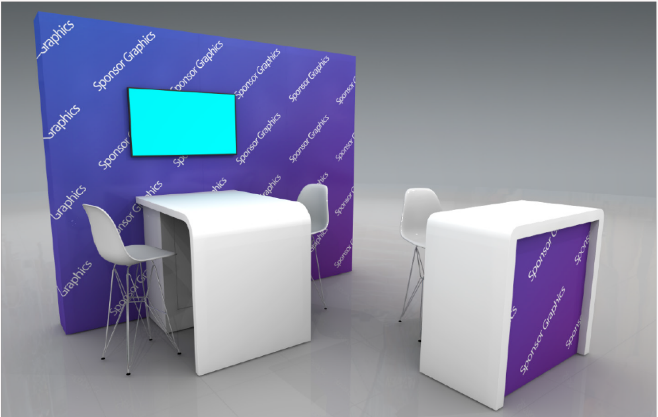
10x10 Booth 15 Total