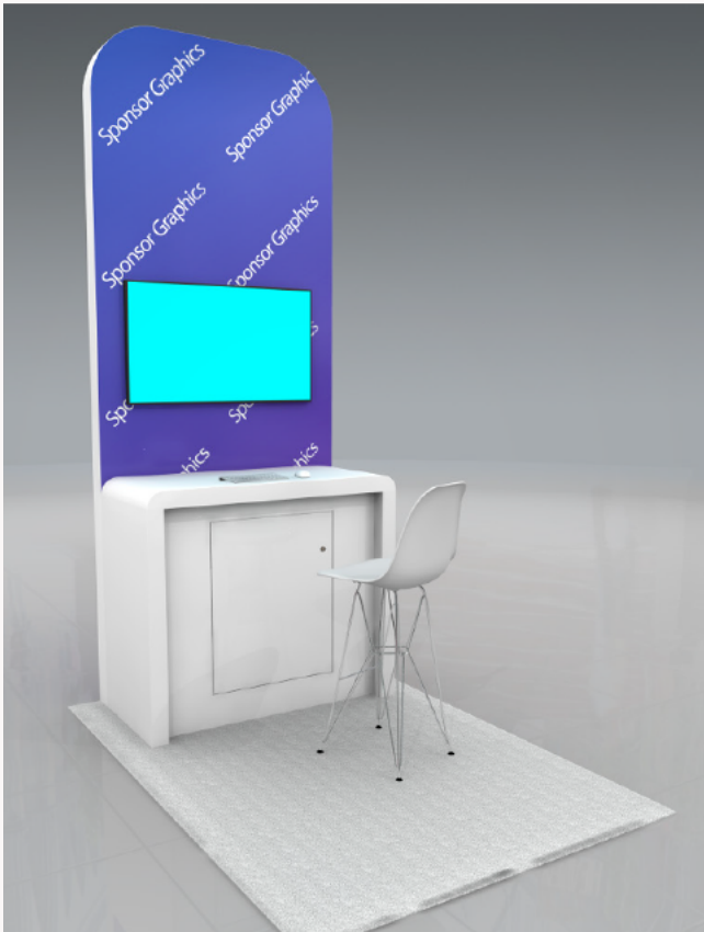
5x5 Kiosk 20 Total